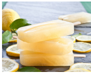
Lemon ginger ice pops with U.S. whey protein

The U.S. Dairy Export Council is a non-profit, independent membership organization that represents the global trade interests of the U.S. dairy industry. USDEC's mission is to enhance demand for U.S. dairy products and ingredients by securing access and assisting suppliers to meet market needs. Stop by our booth and try this year's two prototypes.