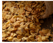
Savory Asian granola with U.S. whey permeate and protein